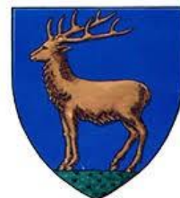
Consiliul Județean Gorj